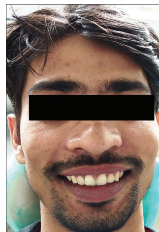
Figure 14: Post-operative view

Excellent results have been shown by various authors who have used composites for diastema closures. [10-12] The composite material used for restorations should have proper handling (nonsticky and non-slumping) and esthetic (polishability) characteristics with high filler content and small particle size. [13] In this case, Filtek Supreme XT with filler loading of 78.5% by weight and a filler particle size of 0.6–1.4 \mu\text{m} was used. [11]