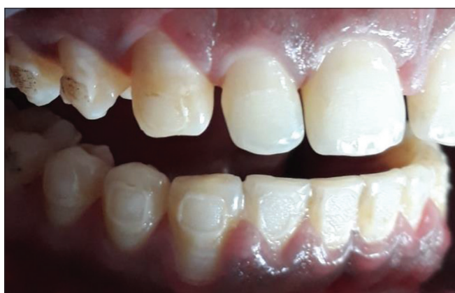
Figure 2: Pre-operative right lateral view