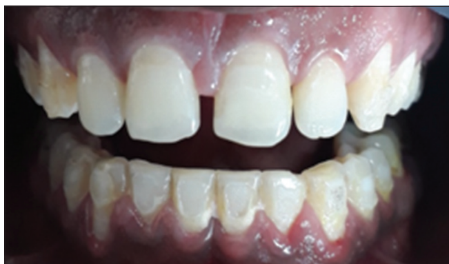
Figure 1: Pre-operative photograph