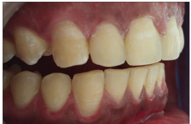
Figure 9: Post-operative right lateral view

advised for the mechanical stimulation of interdental papilla in the region of midline diastema. Figure 13 and 14 showed the difference in appearance of patient before and after the treatment respectively.