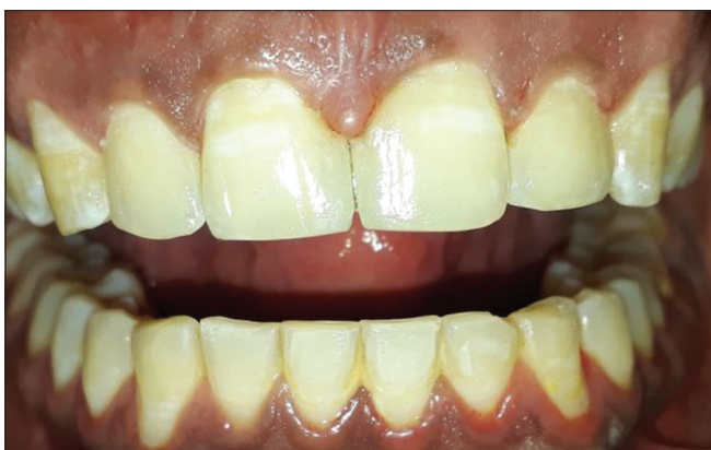
Figure 12: 1 year follow-up

invasive with excellent cosmetic results, especially in young patients. [5] Another added advantage of these materials compared to other treatment options is that these are nonabrasive toward the opposing dentition, and they have easy reparability in case of fracture. In porcelain restorations, if any alteration is to be done, it has to be send back to the laboratory for correction. [8,9]