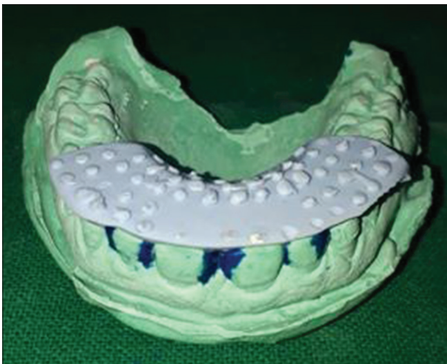
Figure 6: Putty index cut into labial and palatal aspect