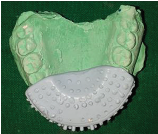
Figure 5: Fabrication of silicone index using putty