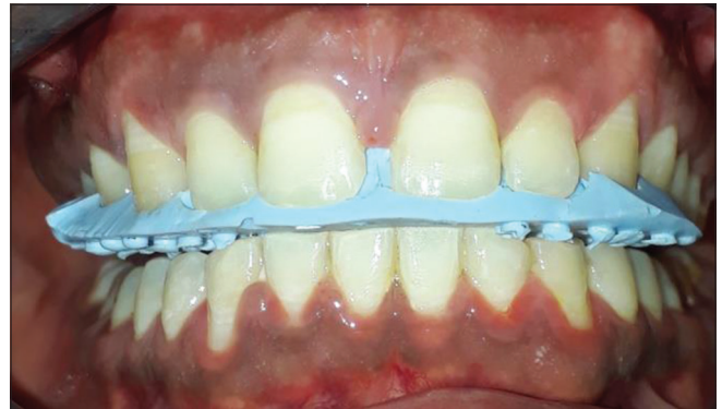
Figure 7: Palatal silicone index seated in the mouth