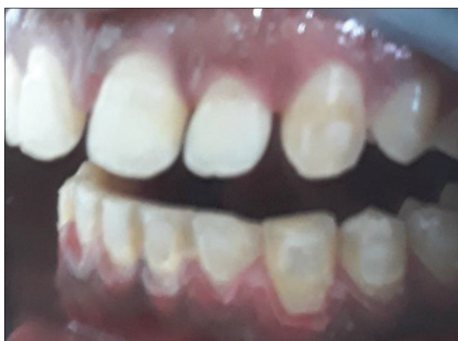
Figure 3: Pre-operative left lateral view

the upper arch. The patient gave the history of orthodontic treatment completed 1 month back for proclined and spacing in upper front teeth. However, after completion of orthodontic treatment, spaces in the anterior maxillary region along with midline diastema were still left.