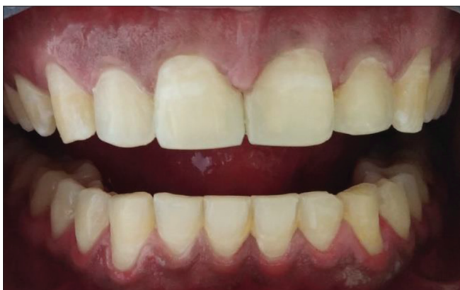
Figure 11: 6 months follow-up