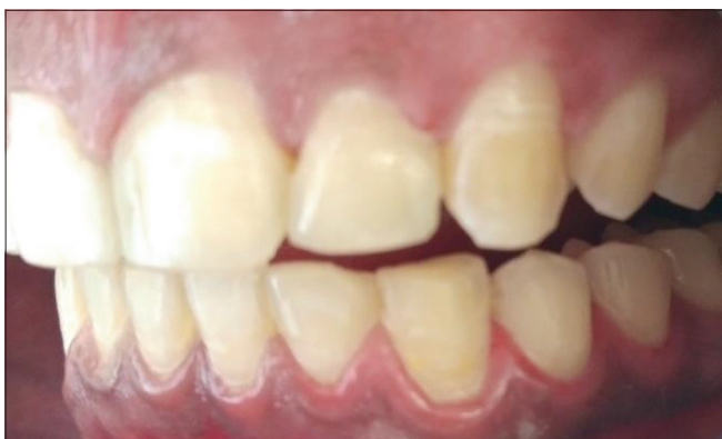
Figure 10: Post-operative left lateral view