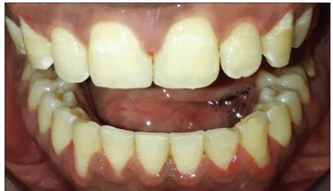
Figure 8: Post-operative view